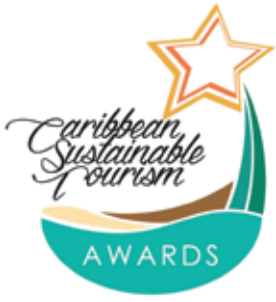
CTO Sustainable Tourism Logo (Freelance)