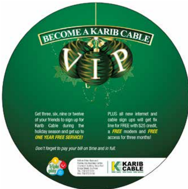
Karib Cable VIP Christmas (OGM Communications)