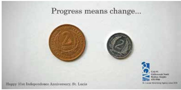
Saint Lucia 32st. Independence